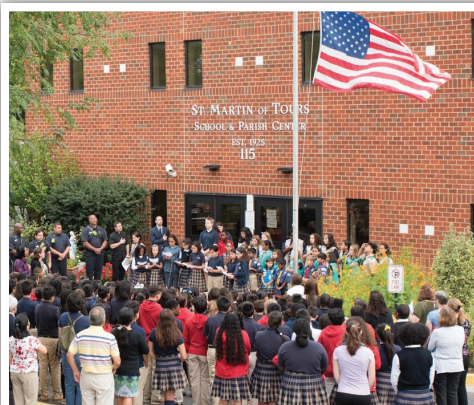
First responders and military joined us for a prayer service in honor of September 11, a day of national remembrance and service.