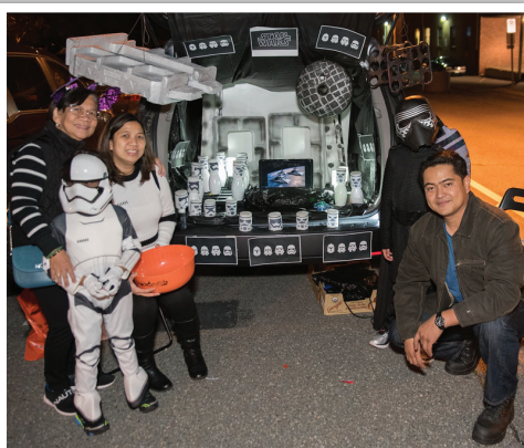
Our families' fang-tastic creativity and spooktacular efforts make for a boo-tiful night at Trunk or Treat.