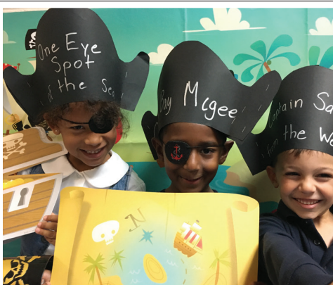
Literacy Night featured a swashbuckling tale of a villainous buccaneer and included pirate-themed activities and snacks.